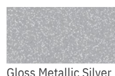
Gloss Metallic Silver

Warranty: Visit www.precor.com for warranty terms.