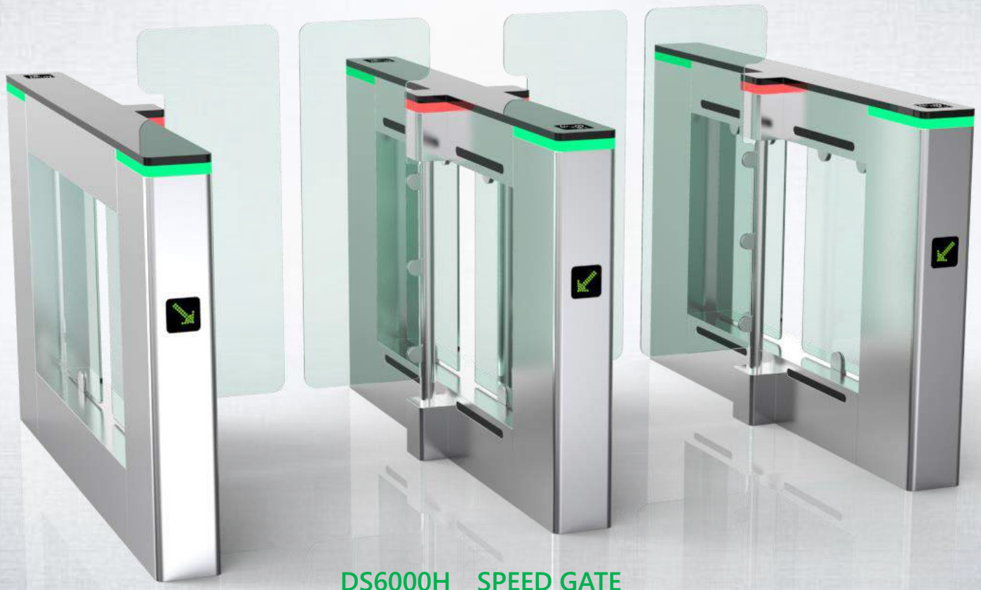
DS6000H SPEED GATE